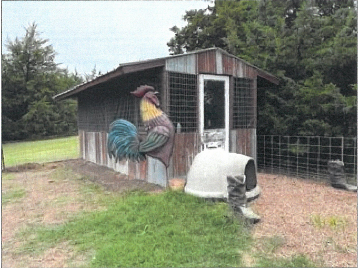
Exhibit 'C': Building Elevations