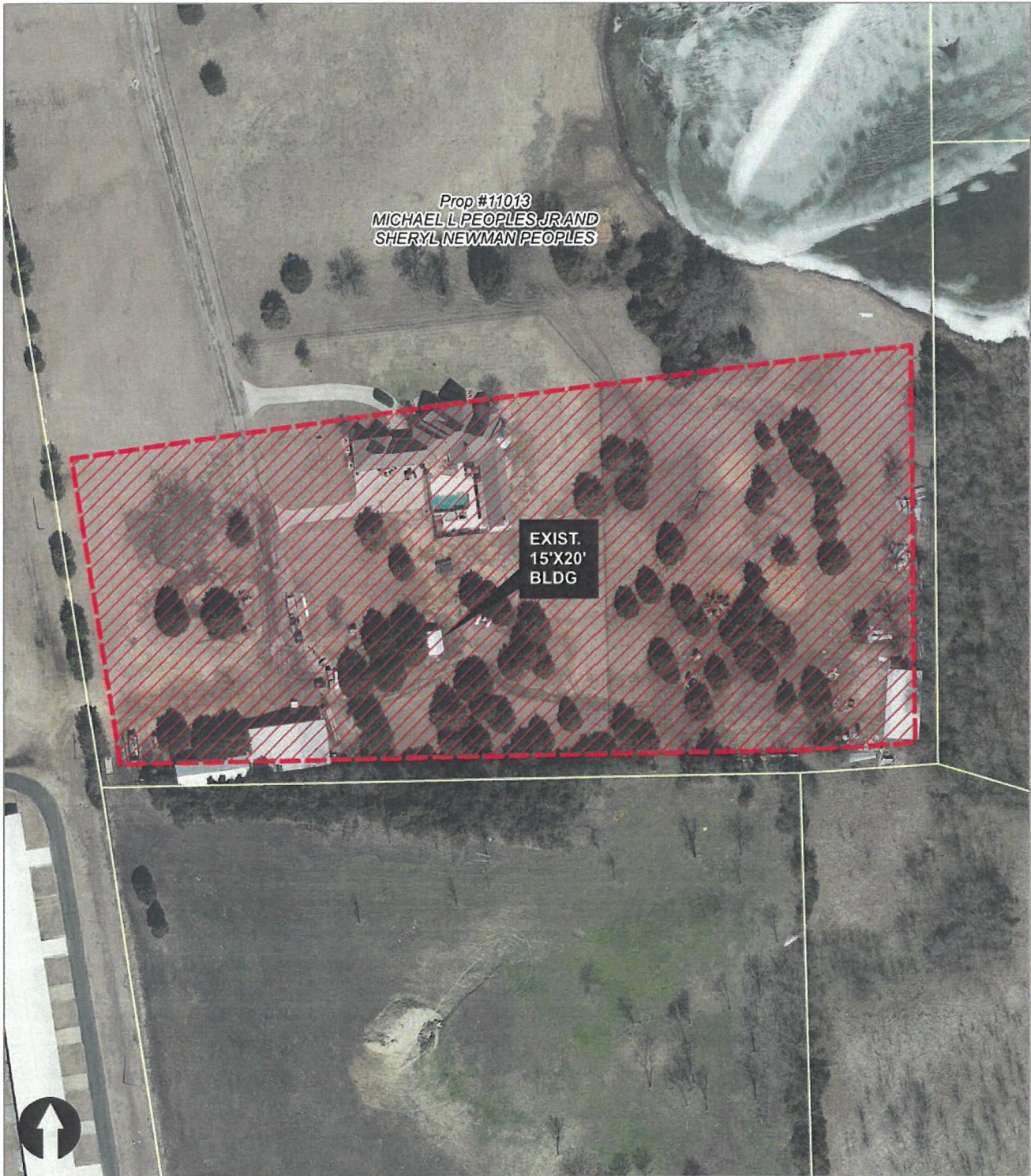
RED CROSS HATCHED AREA: AREA THE CHICKEN COOP CAN BE LOCATED