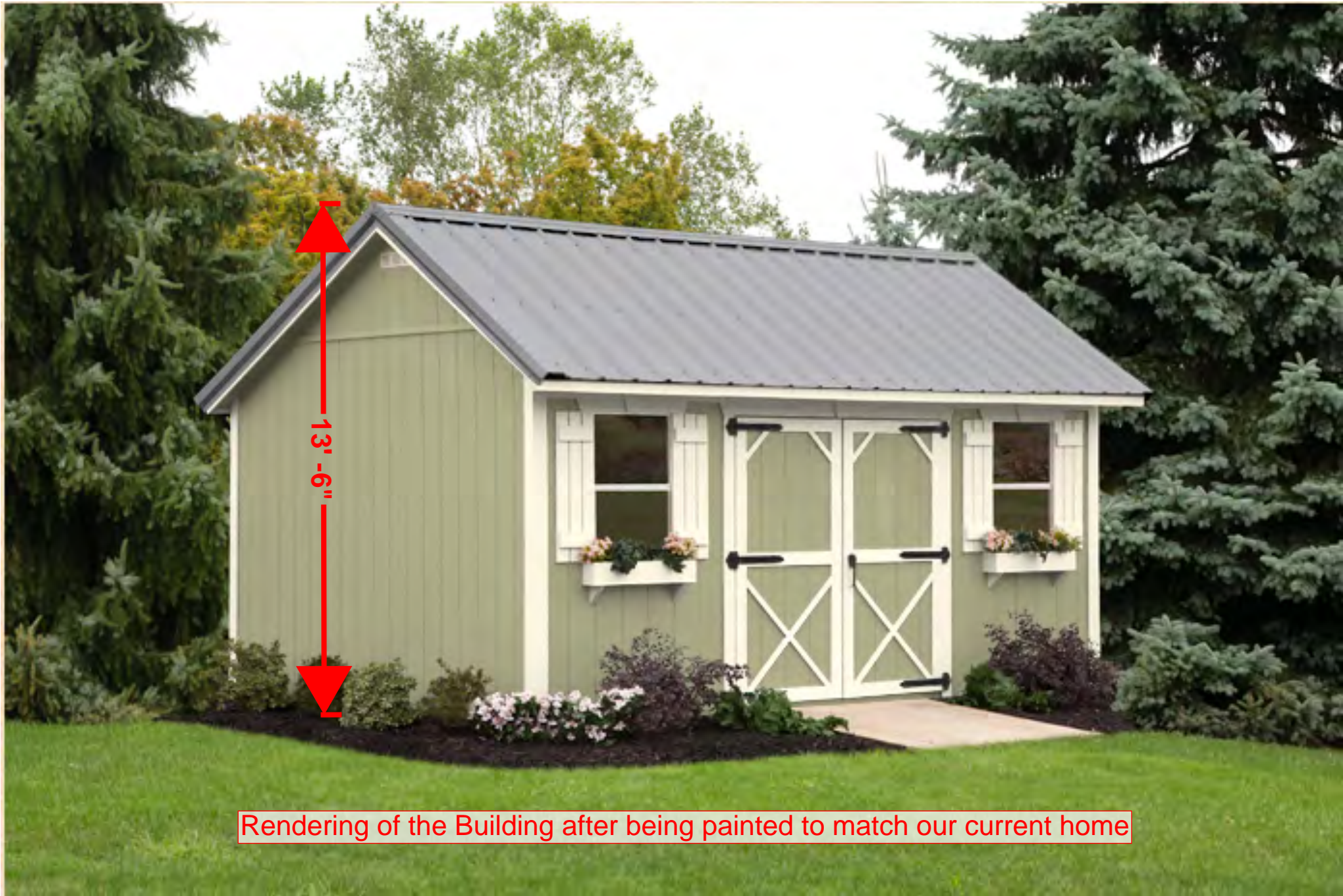
Rendering of the Building after being painted to match our current home