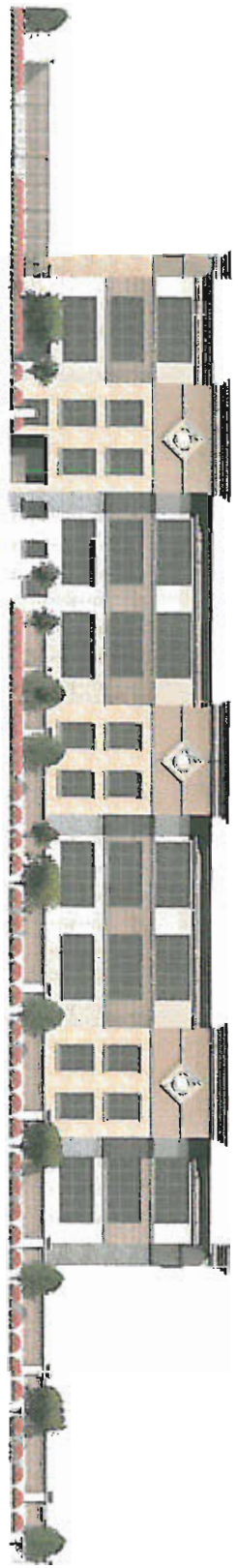
1 EAST ELEVATION EAST SIDE