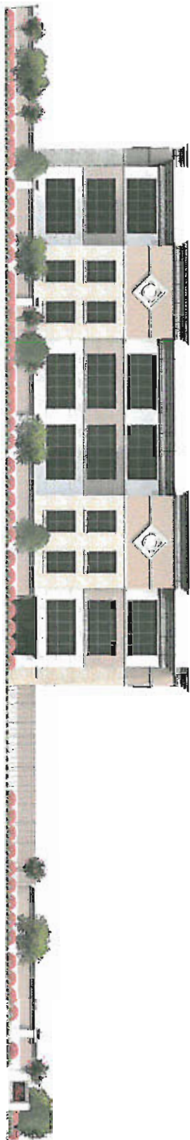
2 SOUTH ELEVATION SOUTH SIDE