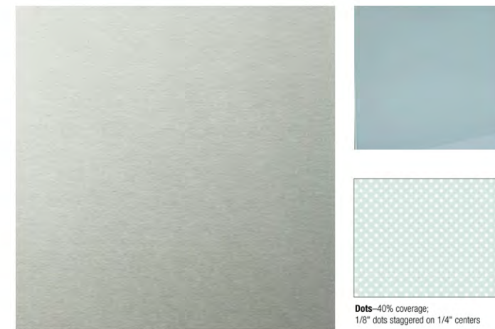
3 ALUMINUM STOREFRONT & GLAZING CLEAR ANODIZED ALUMINUM 1" LOW-E CLEAR GLAZING 1" LOW-E PATTERNED GLAZING