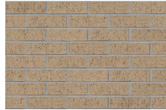
1 BRICK MASONRY ACME BRICK, WEATHERWOOD GRAY