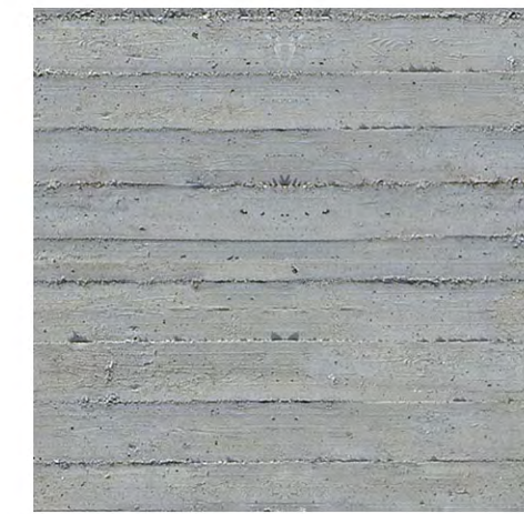
5 ARCHITECTURALLY FINISHED CONCRETE