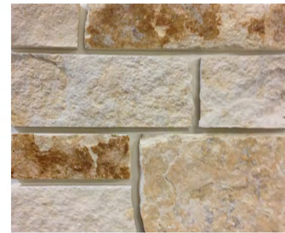
2 LIMESTONE MASONRY TEXAS QUARRIES, WILSON'S BLUFF