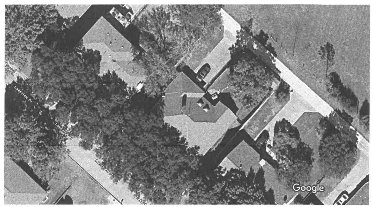
Map data @2024 , Map data @2024 Google 20 ft