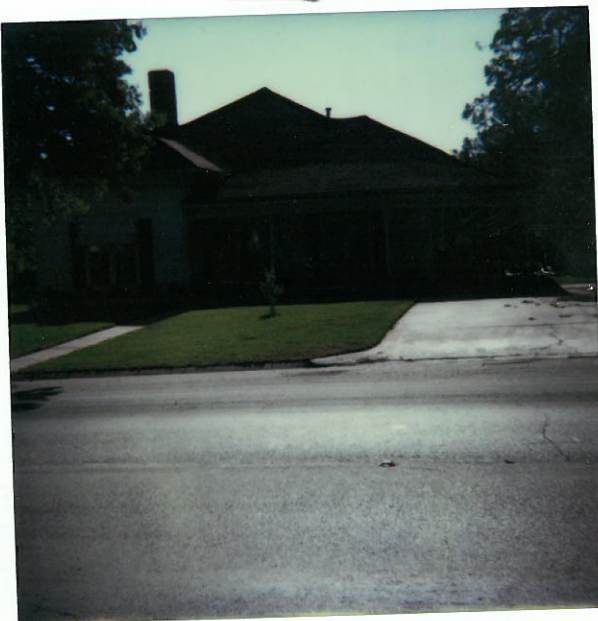
702 N. Goliad