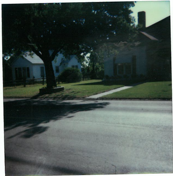
702 N. Goliad