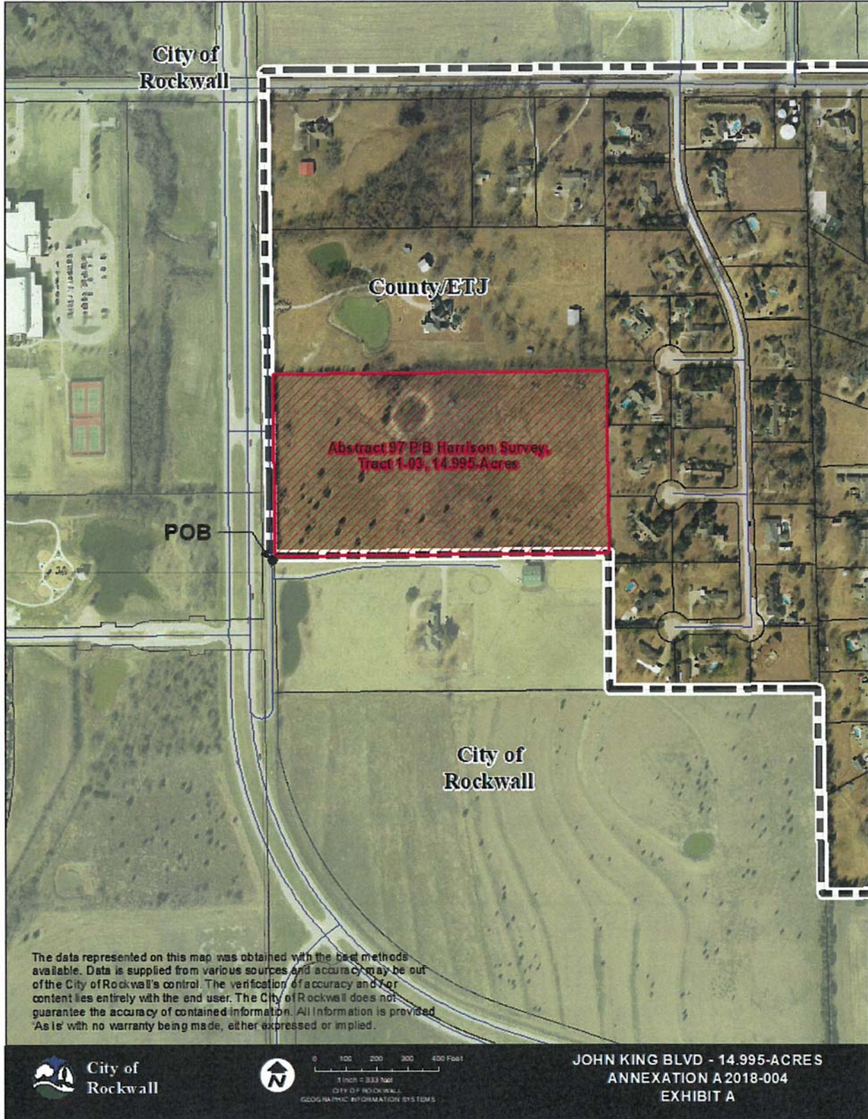
Exhibit 'A' Legal Description/Location Map