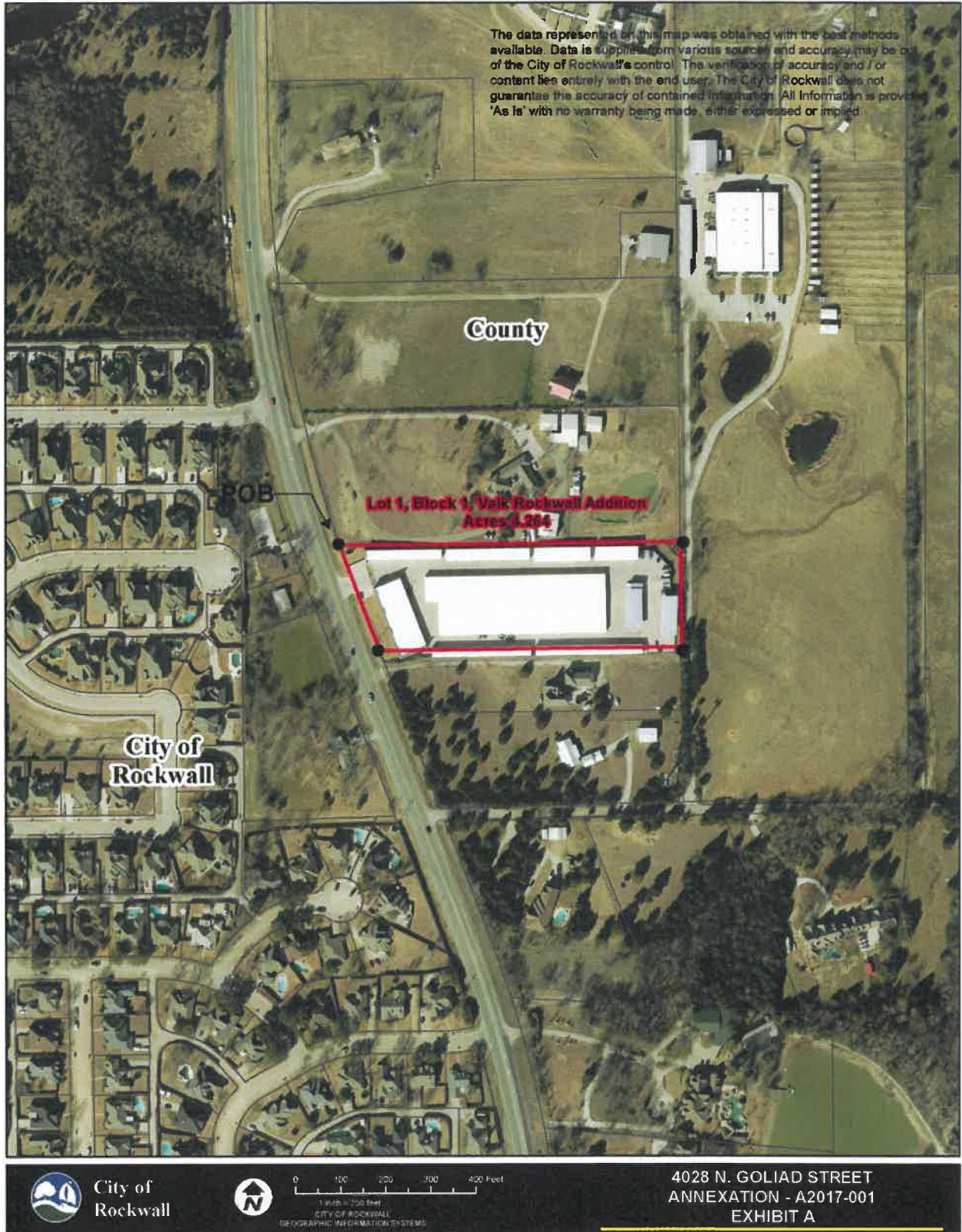
Exhibit 'A' Legal Description/Location Map