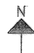
SITE MAP SCALE: NONE