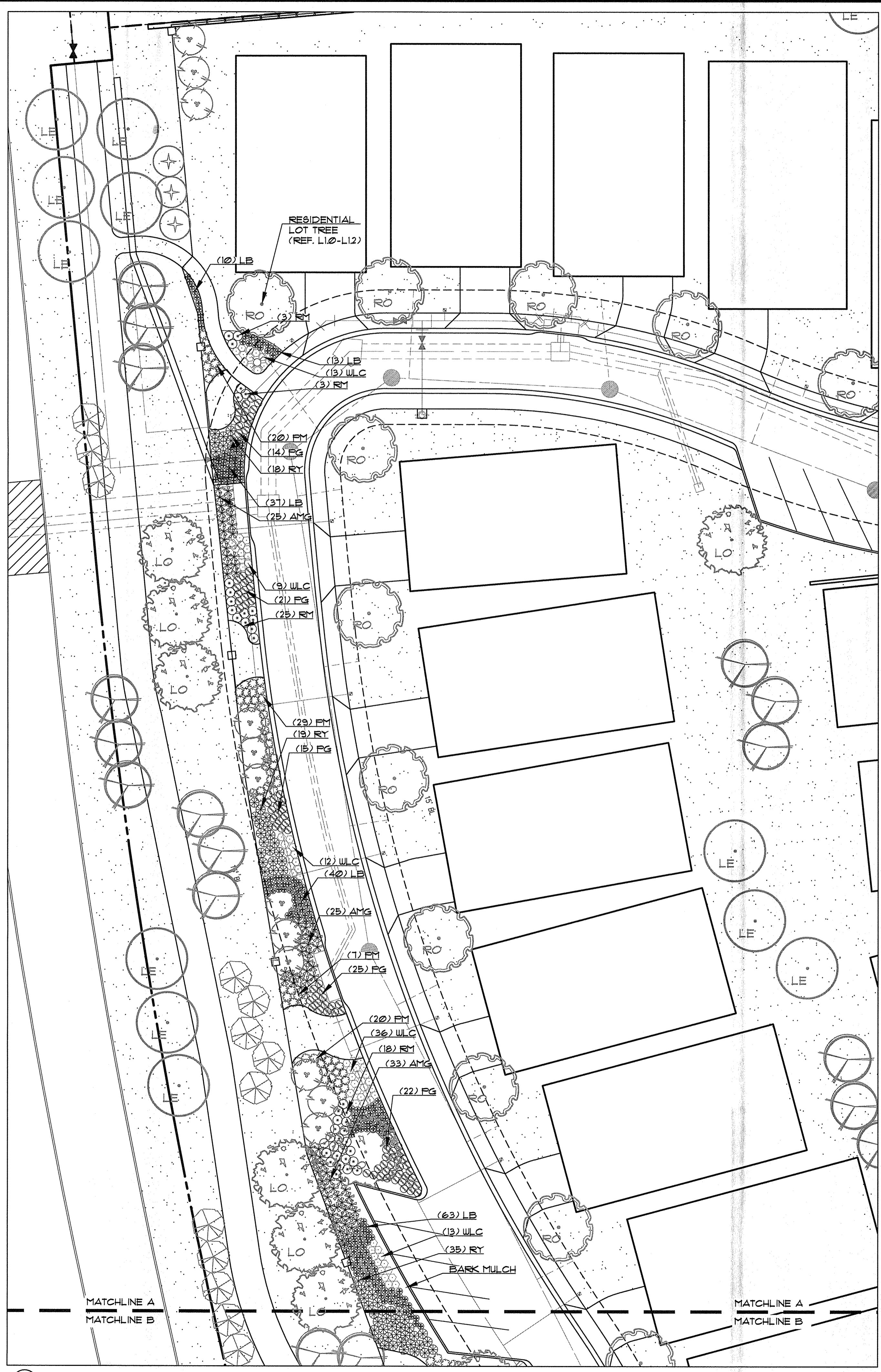
1 DETAIL A SCALE: 1"=20'

File: P:\2017\17018\Drawings\17018 - LADERA ROCKWALL PHASE 1 - LANDSCAPE.dwg Date: 02/23/2018 10:45:00 AM User: jdelin