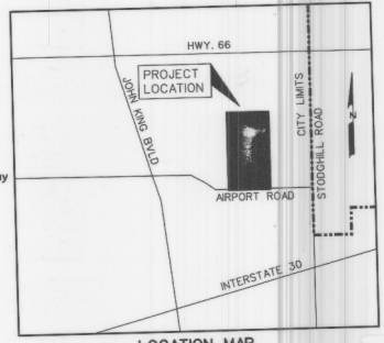
LOCATION MAP N.T.S.